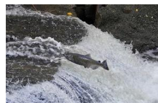
December 5 th at Campbell Avenue underpass

I would encourage all Flycasters to become involved in this year's survey which will start November of 2023. Until then SBCCC will continue its Team 222 bi-monthly Creek Cleanups. The next one is March 11, 2023, details will appear on the SBCCC website.