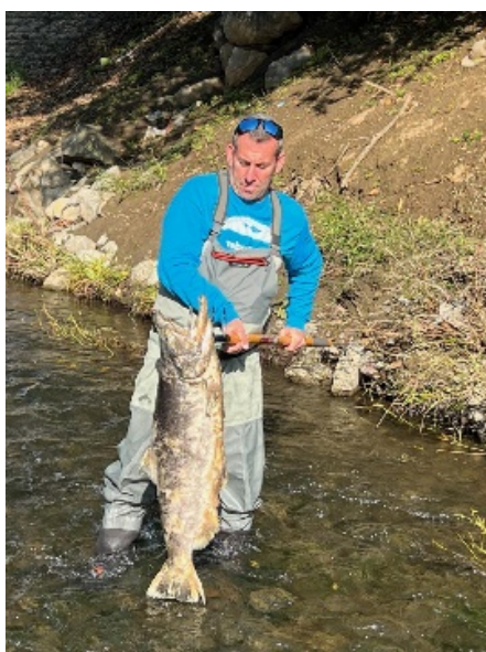
36 ½ in 30+ lb. male collected on Los Gatos Creek