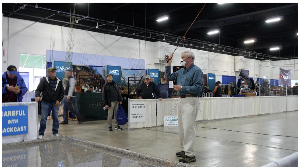
There were many casting demos from big industry names like Gary Borger.