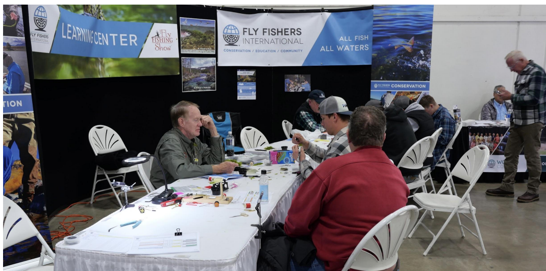
NCCFFI offered fly tying and rod casting lessons.