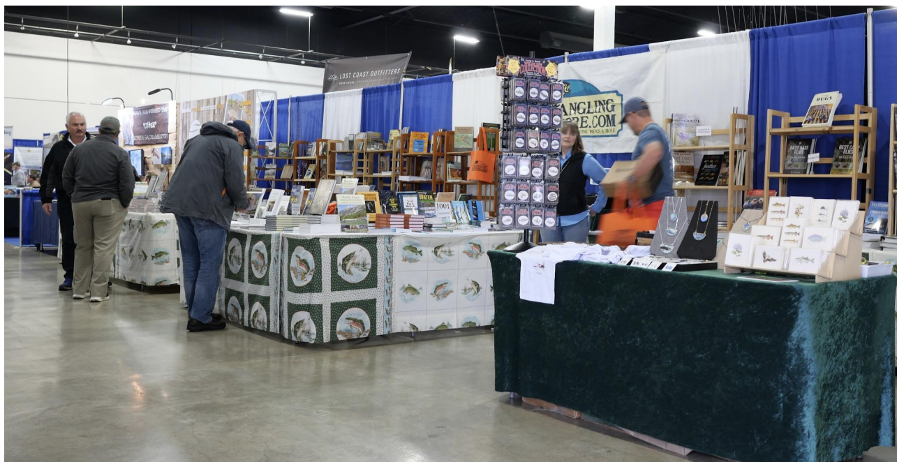
The show's bookstore was another great place to make your wallet feel a lot lighter.