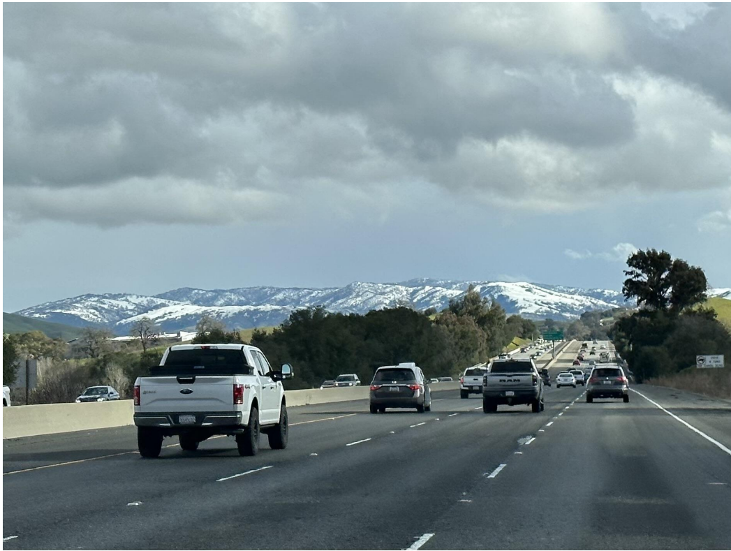
Who called for snow? Blame it on our friends from the rest of the country for bringing the weather with them!