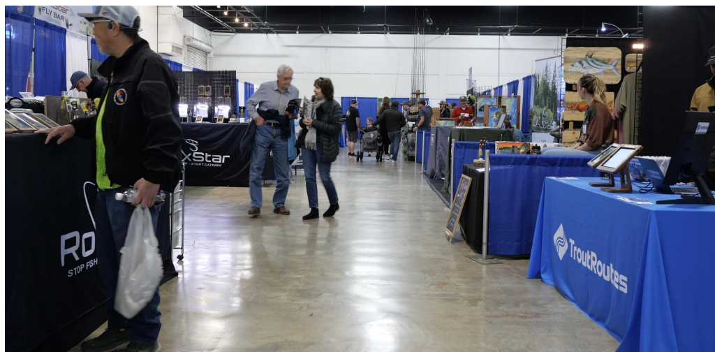
It was fun walking the aisles to see what vendors had to offer this year.