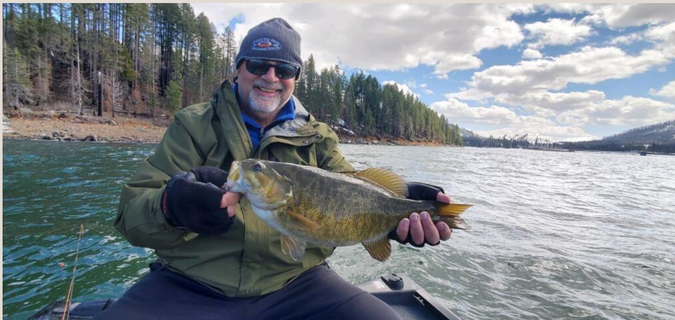
30-INCH STRIPED BASS | BILL